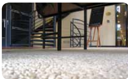
Offices & Lobbies