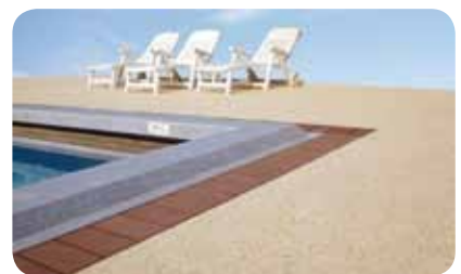
Hotels & Resorts