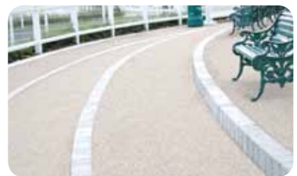
Walkways & Paths