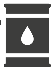
Used Engine Oil